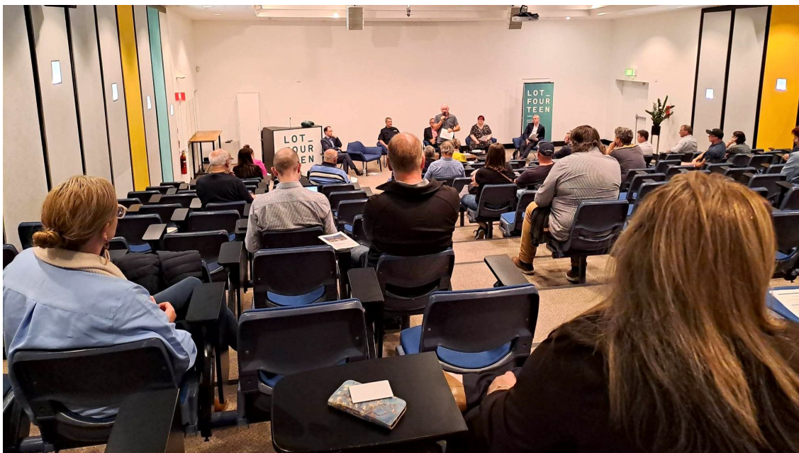
A flood recovery community meeting was held in Adelaide last week at Lot Fourteen.

Future meetings are currently being organised and local communities will be informed as they are finalised. To view the most up to date community meeting schedule visit sa.gov.au/floods .